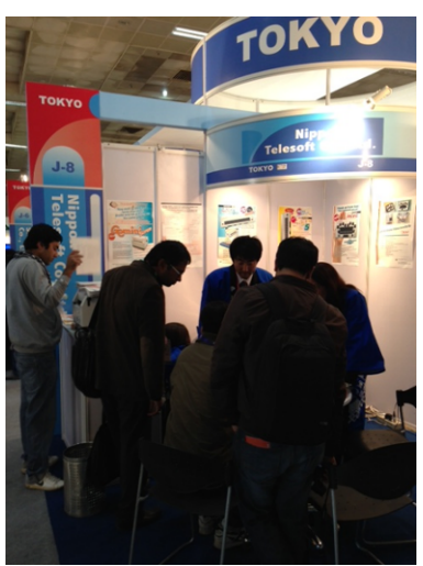
Nippon Telesoft Co., Ltd. [Industrial machinery]