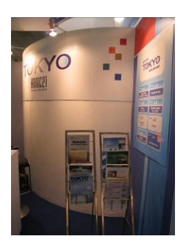
Display of some of the pamphlets etc. from each city