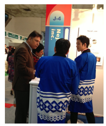
NejiLaw inc. [Machinery parts]