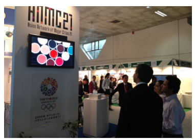
Screening of the Tokyo tourism DVD "TOKYO COLORS"