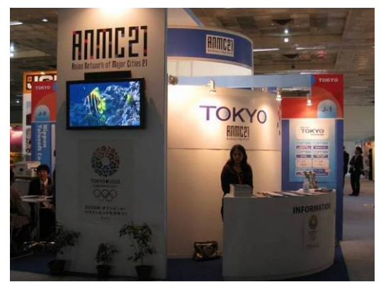
Tokyo Pavilion Information Booth (Conducted the PR of ANMC21 and each city)