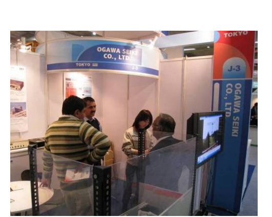
Ogawa Seiki Co., Ltd. [Trading Company] Products by three industrial machinery companies were coordinated and exhibited