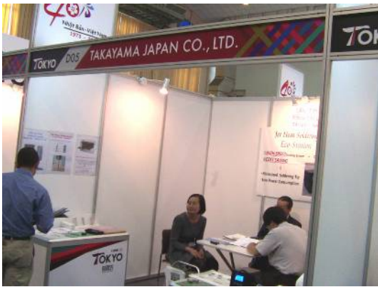
TAKAYAMA JAPAN CO.,LTD.