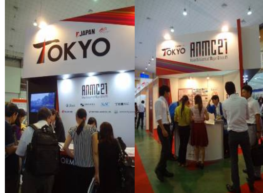
Left: Information booth of Tokyo Pavilion Right PR booth (PR for ANMC21, Policies of Tokyo, and ANMC21 member cities)