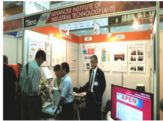
ADVANCED INSTITUTE OF INDUSTRIAL TECHNOLOGY (AIIT)