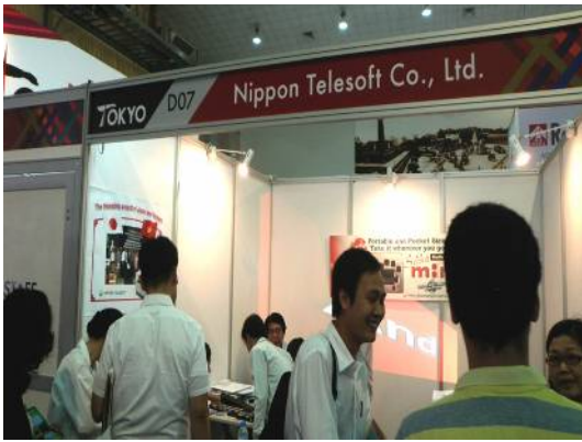
Nippon Telesoft Co.,Ltd.