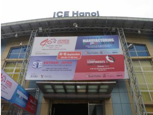
Exterior appearance of Hanoi International Center for Exhibition (PR of 4 exhibitions)