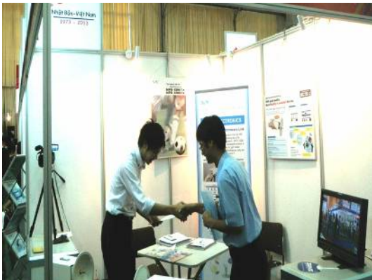
NIPPO ELECTRONICS CO.,LTD.