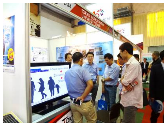
Tokyo Metropolitan University (TMU)