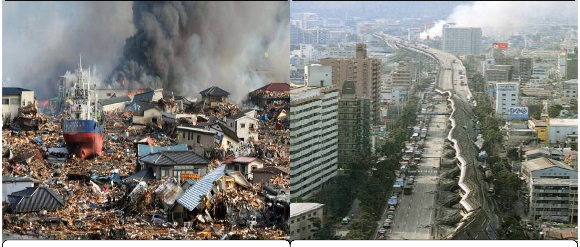
Plate Subduction Earthquake