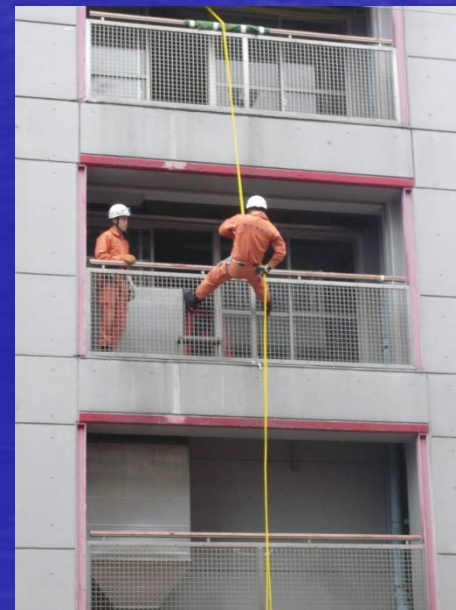
Rescue Techniques Course