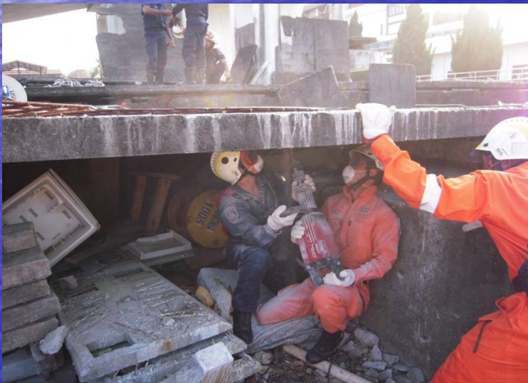
International Urban Search and Rescue Course

(3) Participation in Comprehensive Disaster Management Drill