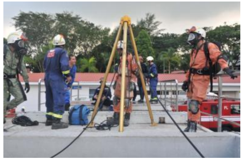
Preparation for entry