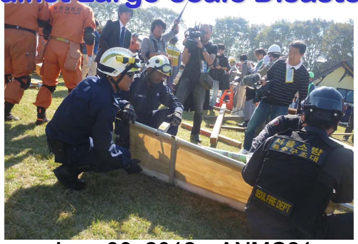
June 30, 2012 ANMC21 Secretariat