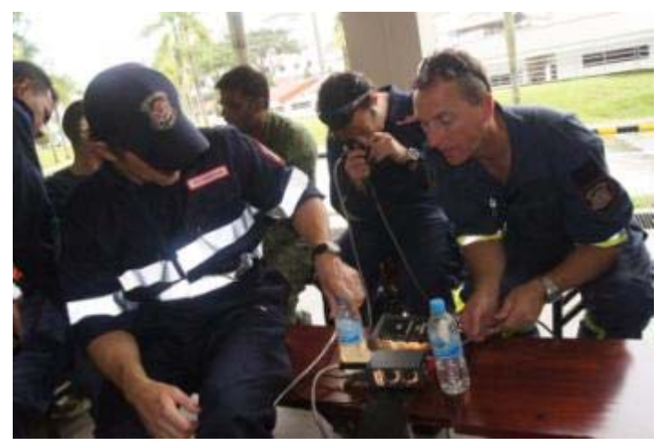
Fibre Optic Scope