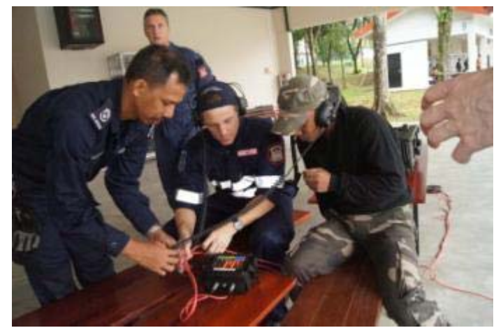
DELSAR Listening Device