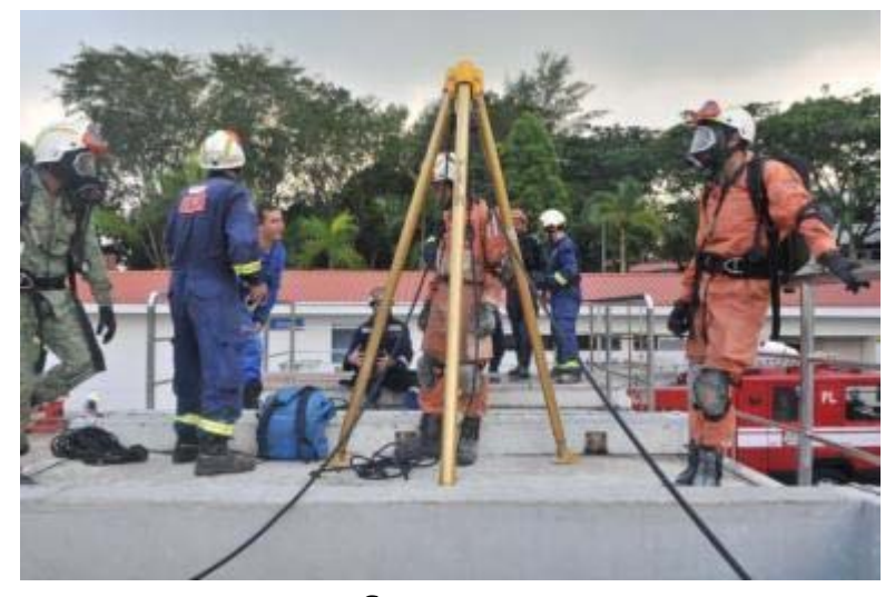
Preparation for entry