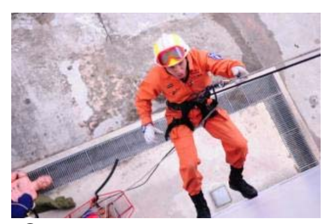
One man rescue