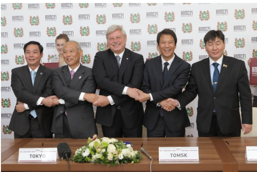
Signing Ceremony of Tomsk Declaration