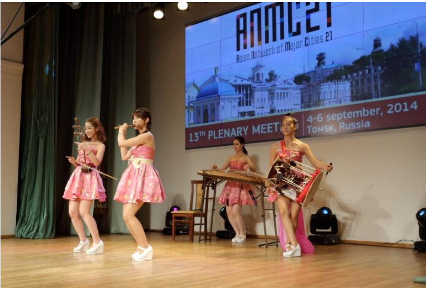
Performance given by artists from Seoul