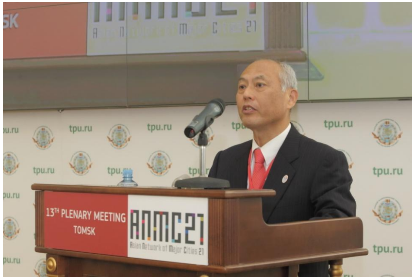
Opening remarks by HE MASUZOE Yoichi , Governor of Tokyo