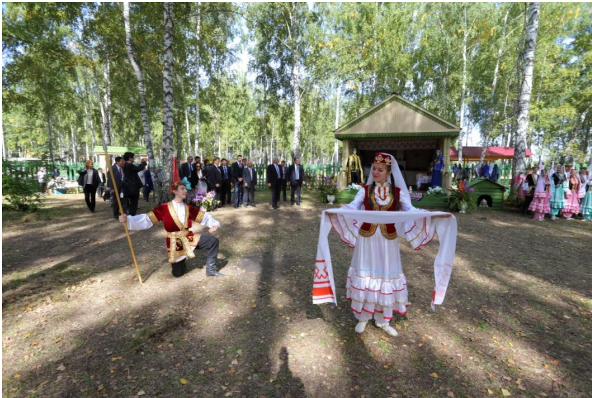
Site Visit to Park “Okolitsa”