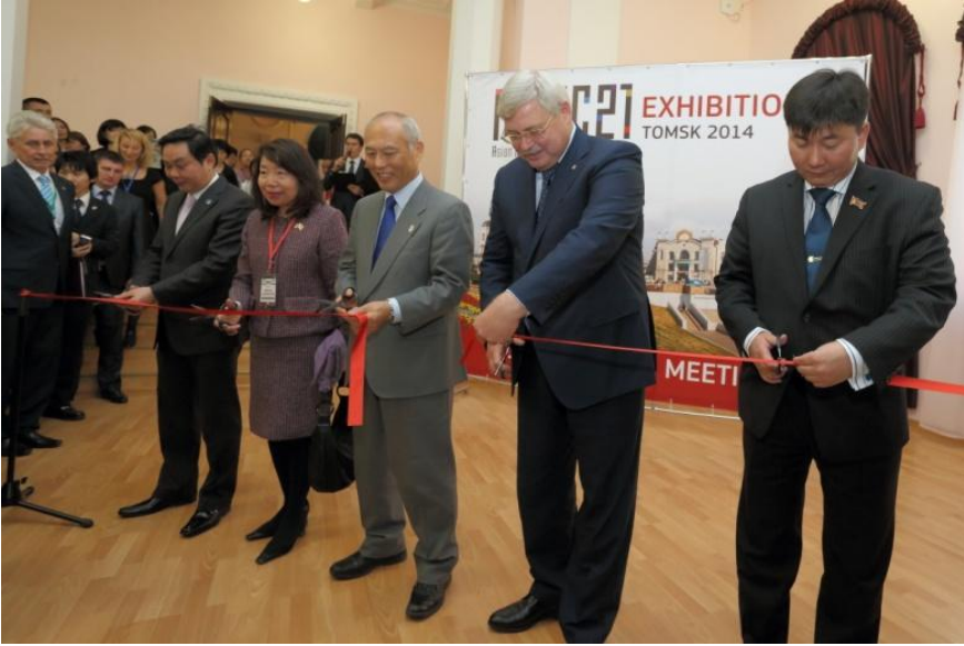
ANMC21 Exhibition Ribbon snipping ceremony