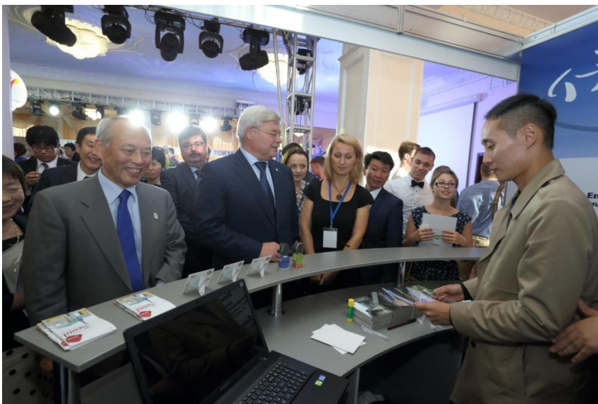
Seoul City PR Booth