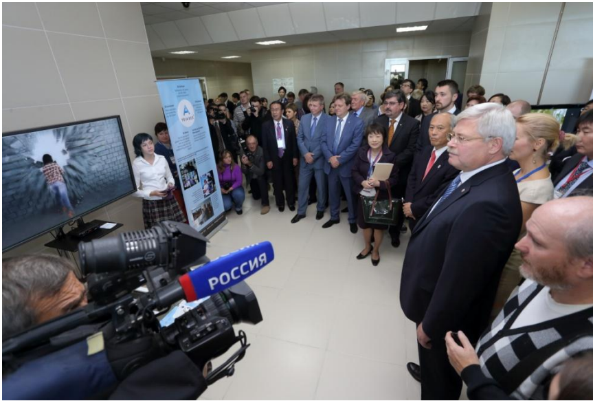
Field Trip to Tomsk Special Economic Zone