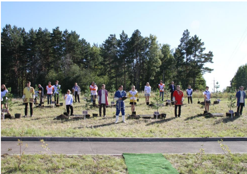
Opening of Ecology park in Tomsk Special Economic Zone