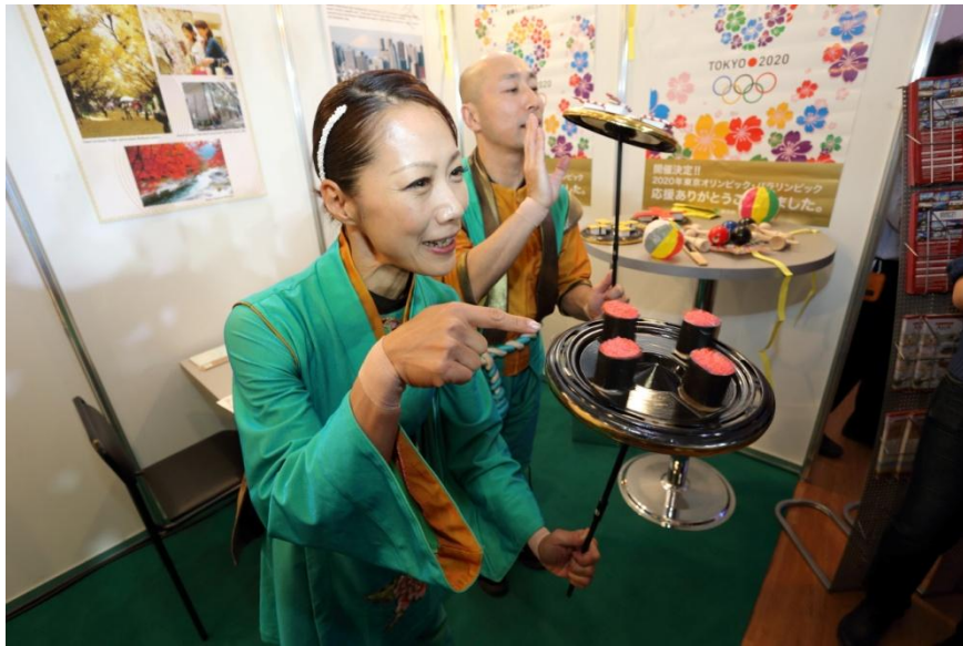
Tokyo City PR Booth