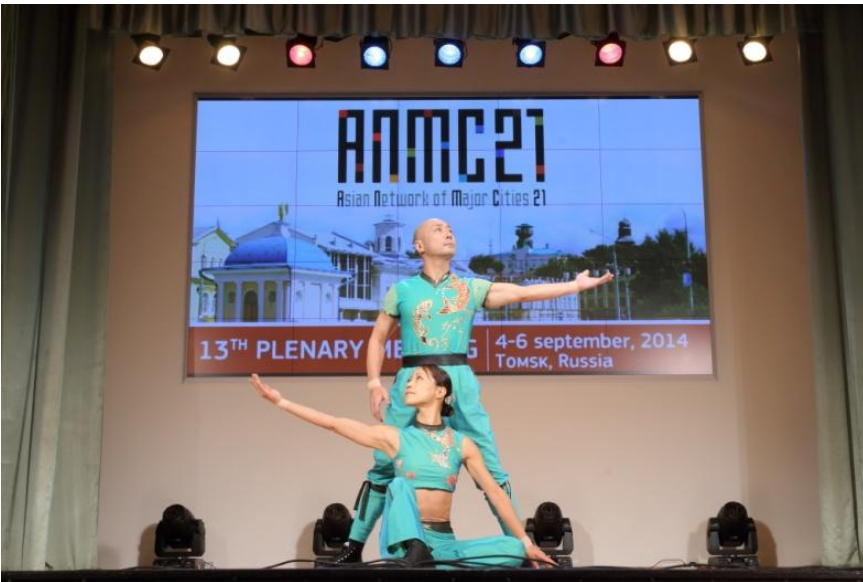
Performance given by artists from Tokyo