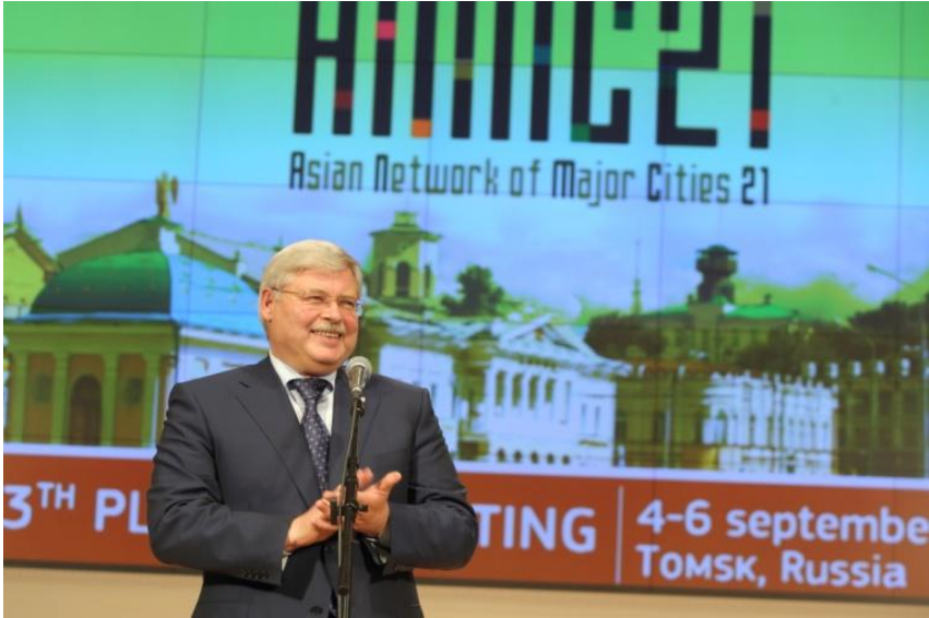
ANMC21 Exhibition Opening remarks by HE Zhvachkin Sergey, Governor of Tomsk Region