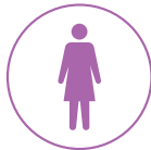
► Expand occupations and roles for women