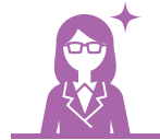
► Promote the placement of women in management positions