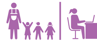
► Daycare services at the workplace